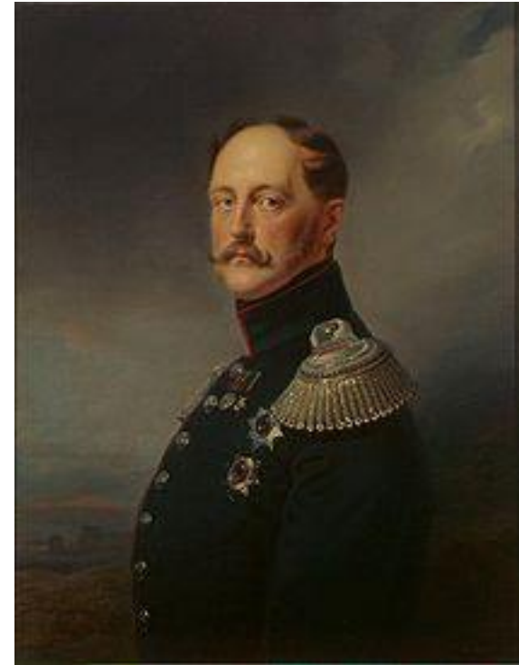
Tsar Nicholas I of Russia